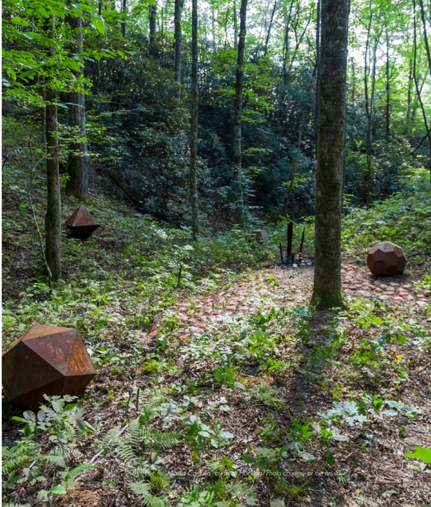
"Massa Confusa" by Scott Hocking.

The other installation was commissioned by Dashboard and created by Scott Hocking of Detroit, Michigan. Massa Confusa is based on ideas of chaos, prima materia, alchemical transformation, sacred geometry, creation mythologies, Cherokee and Mississippian cultures, ceremonial and archaeological sites, obscure objects of worship, and the varied symbolism of the terrapin. The installation incorporates numerous Platonic and Archimedean Solids, approximately 200 terra-cotta artifacts, and 1 burnt offering of the primordial egg (the Massa Confusa ), to create a mystical sacred space.