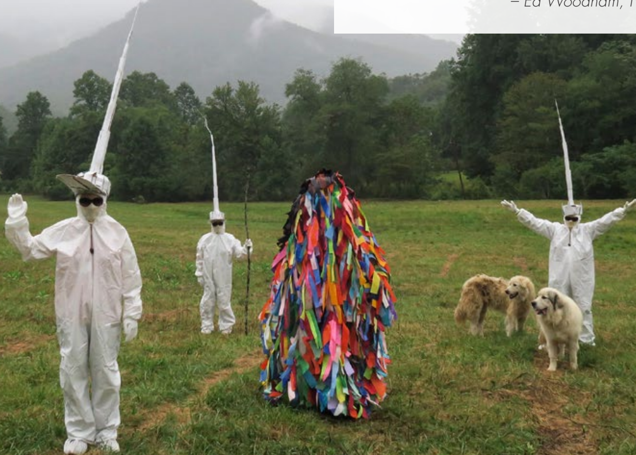
A performance of "TEOTS - Total Eclipse of the Sun" by Ed Woodham.