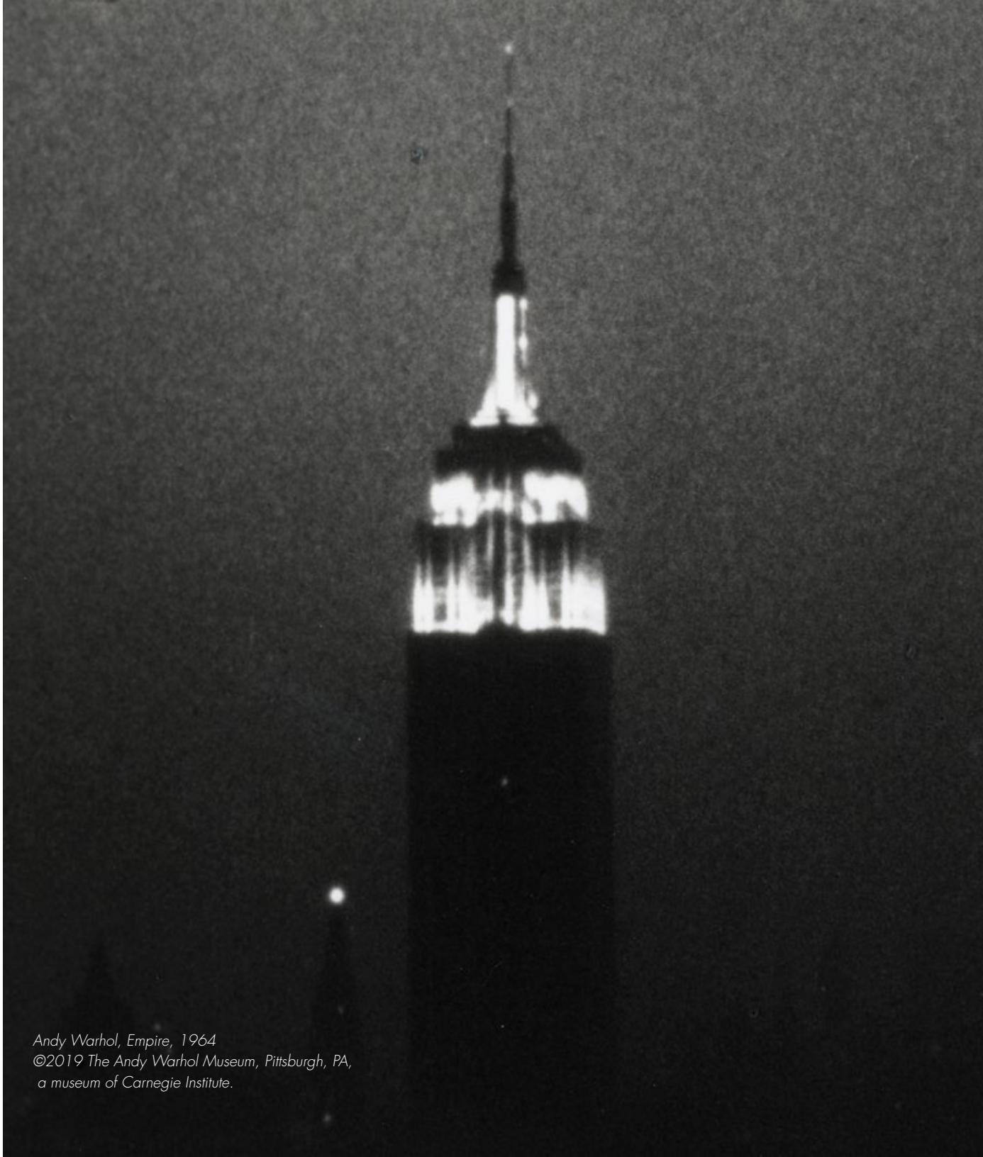
Andy Warhol, Empire , 1964

The presentation made a splash and was written about in an Atlanta Journal Constitution article.